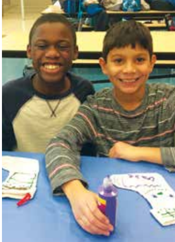
▲ Extended-Time (ET) boys during Winter break program

Woodrow Preschoolers working on a STEM project (Yes we begin STEM lessons in Preschool!!)