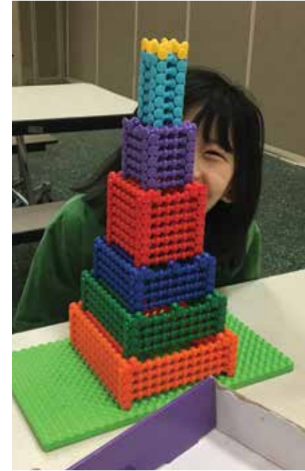
▲ Central Trail After-School child proud of her accomplishment

Meeting Our Mission: To provide safe, quality child care in a learning environment